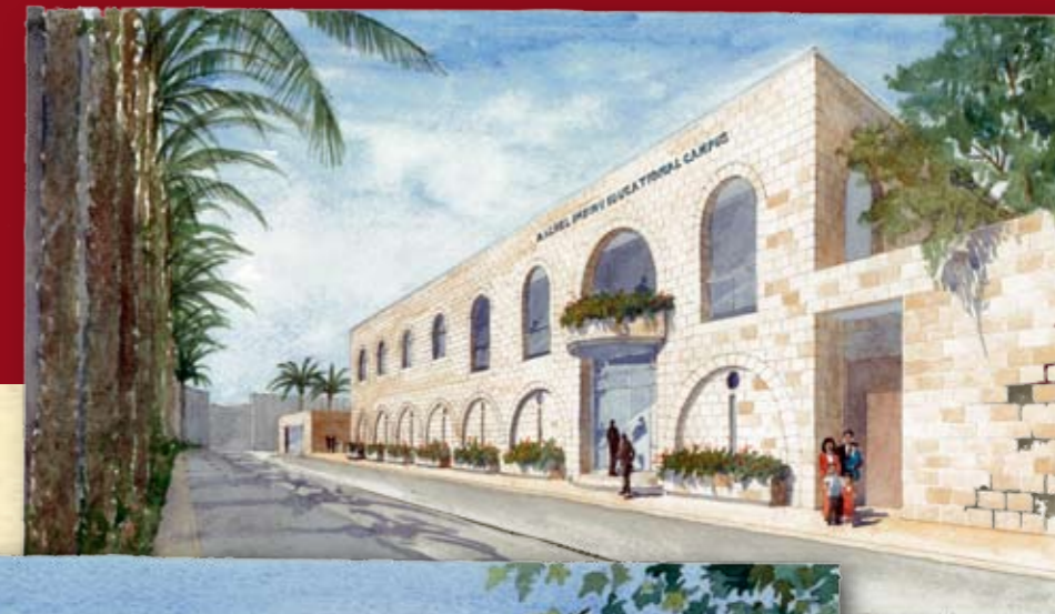
Rendering of Proposed Rachel Imeinu Educational Campus

I t is rare that the Jewish people are presented with such an extraordinary opportunity.