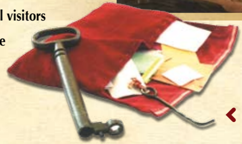
Key to Kever Rachel, 1906