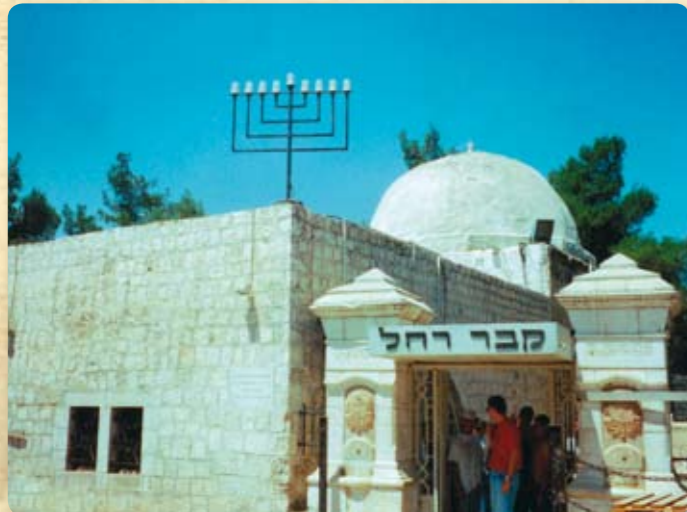
| Kever Rachel before 1998