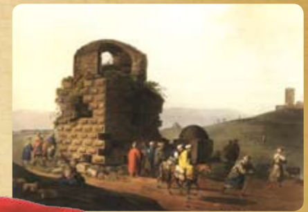
Kever Rachel 1803