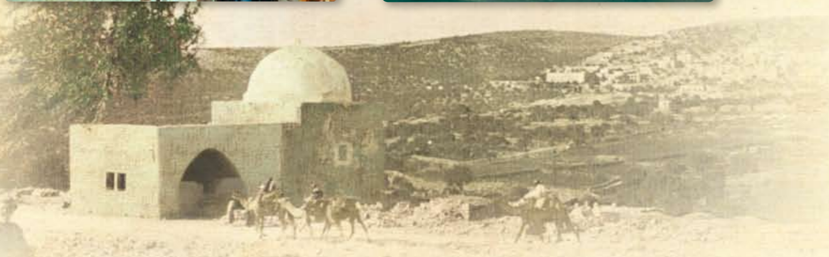
| Kever Rachel around 1900