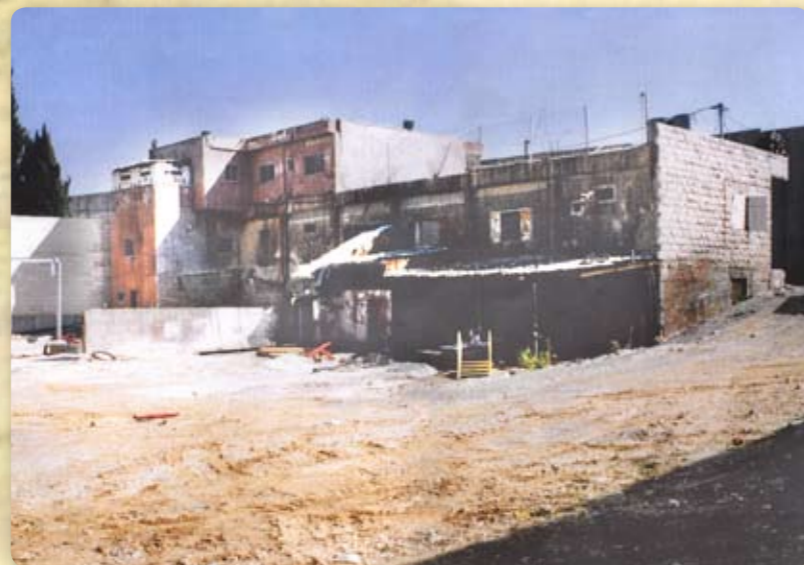
Building > (viewed from back) to be converted to the Educational Campus.

You can be part of this exciting and bold enterprise. An enterprise that promises to transform the heritage of Rachel, our Mother, into a vibrant and dynamic force among the Jewish people worldwide.